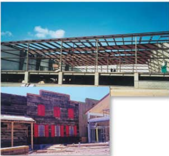
Billy The Kid Casino, Ruidoso Downs, NM