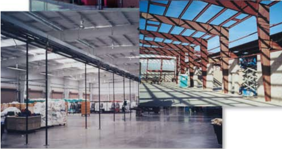
Mission Industries, North Las Vegas, NV. Systems Builders Association, 1999 Building of the Year.