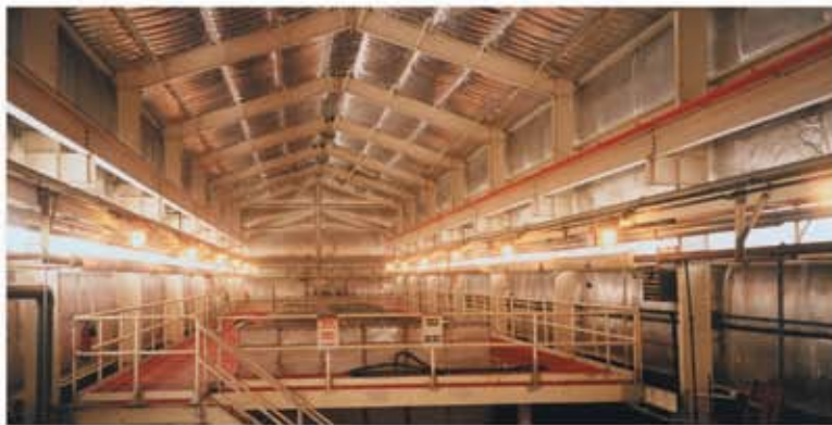
Electrowinning Tankhouse, Mongolia