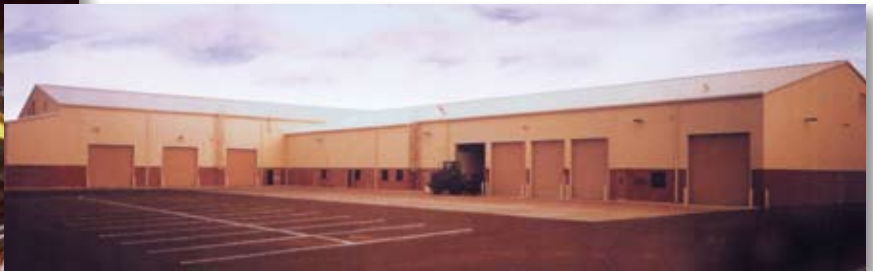
U.S. Army Corps of Engineers, Davis Monthan Air Force Base, Vehicle Maintenance Building, Tucson, AZ