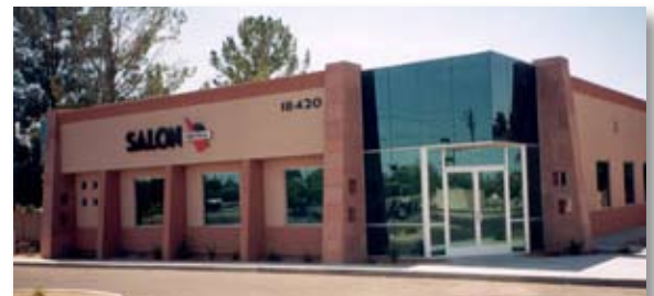
Salon Central, Phoenix, AZ