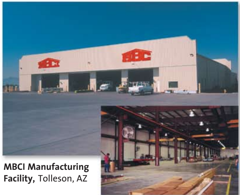
MBCI Manufacturing Facility, Tolleson, AZ