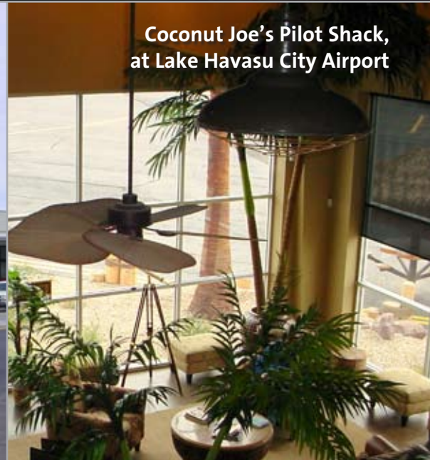
Coconut Joe's Pilot Shack, at Lake Havasu City Airport