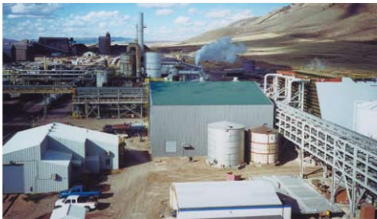
Jacobs Engineering, Phosphate Processing Plant, Conda, ID