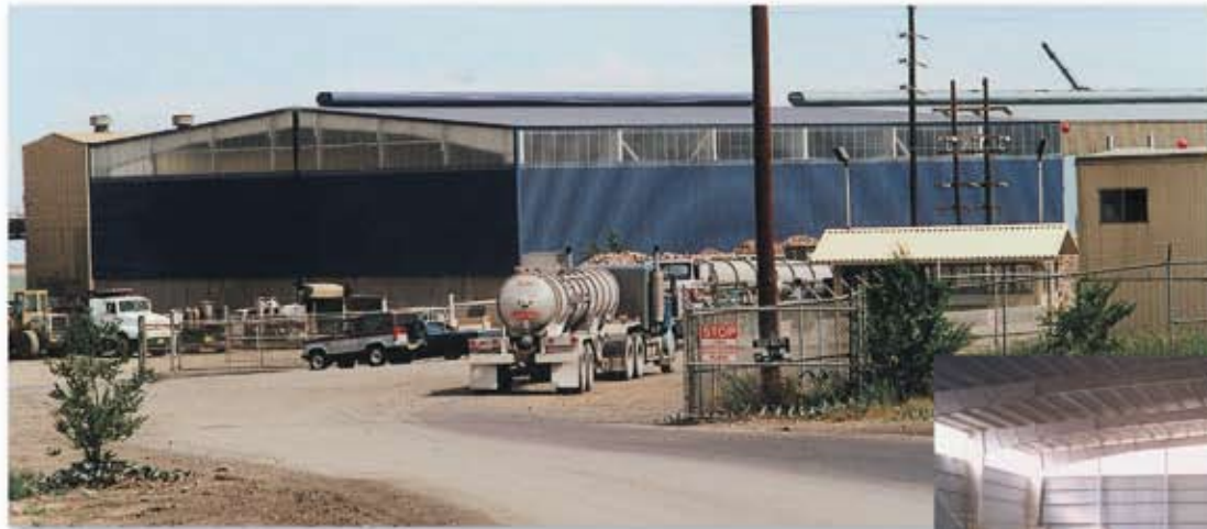
Flux and Precipitate Storage Building, Hurley, NM