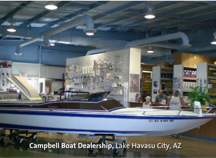
Campbell Boat Dealership, Lake Havasu City, AZ