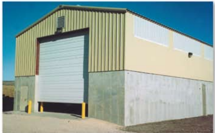
ADOT Chemical Storage, Seligman, AZ