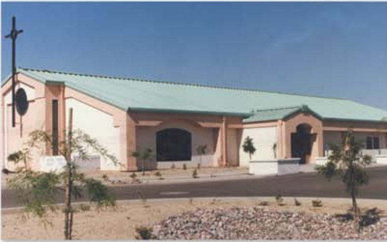
Paradise Valley Church, Paradise Valley, AZ