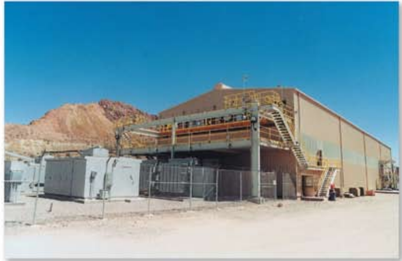
Electrowinning Tankhouse, Marana, AZ