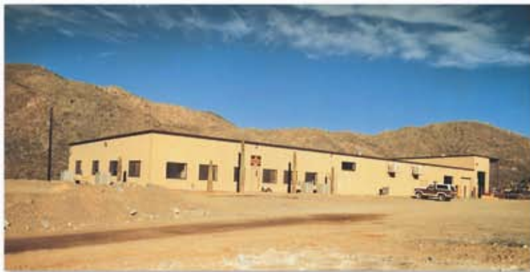
Administration/Warehouse/Shop Building, Congress, AZ