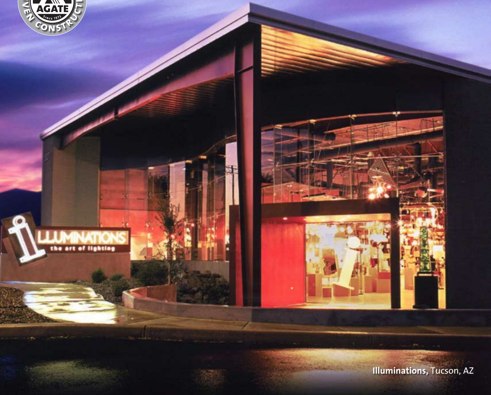
Illuminations, Tucson, AZ