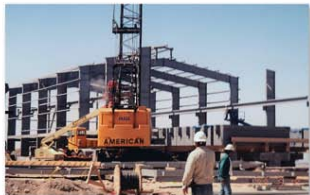
Electrowinning Tankhouse, Tonopah, NV