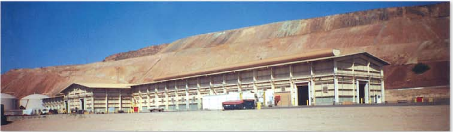
Electrowinning Tankhouse, Morenci, AZ