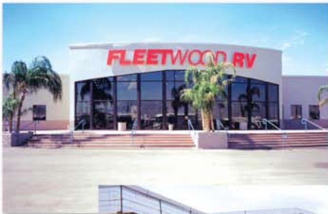
Fleetwood RV, Tucson, AZ